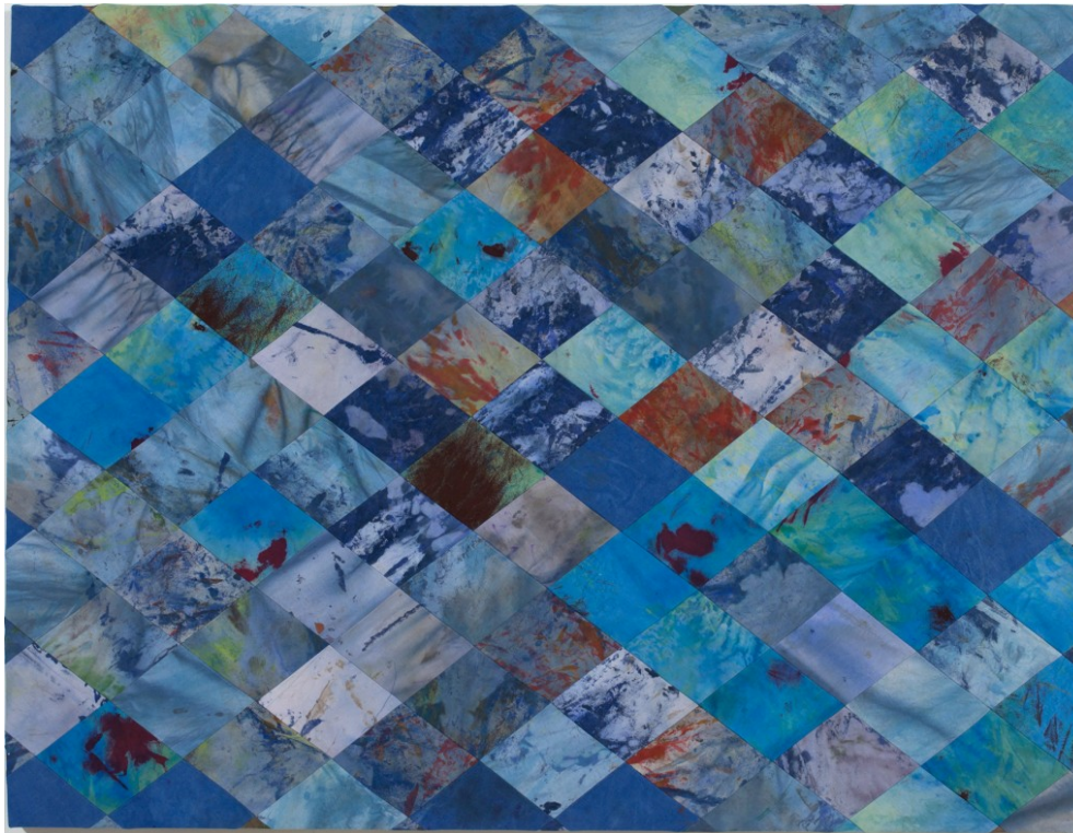
Men's Shirts. {2014} paint on cotton fabrics [Brad and David's t-shirts from performance sessions 7/8/9; with dyed canvas and cotton dress shirts on verso] 40" x 51". Jonathan VanDyke/Courtesy the artist and Loock Galerie, Berlin.

The diamond of the Harlequin is a flattened facet. His fashion is at once costume of the devilish trickster and uniform of the aristocracy's entertainer. He wears all dimensions one next to the other in a field of vision that suggests depth—and yet always slips into a smooth plane of illusory pattern.