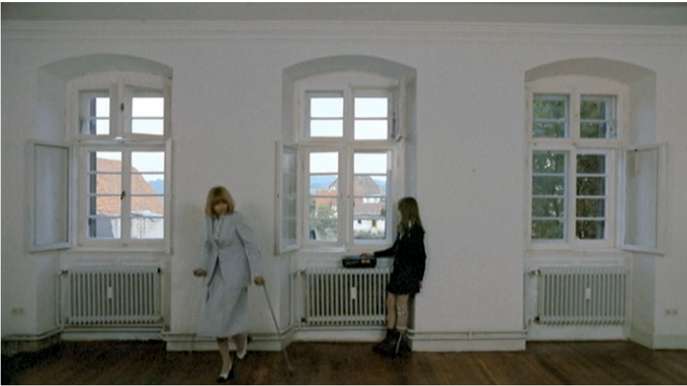
film still from Chinese Roulette (1976) Directed by Rainer Werner Fassbinder.