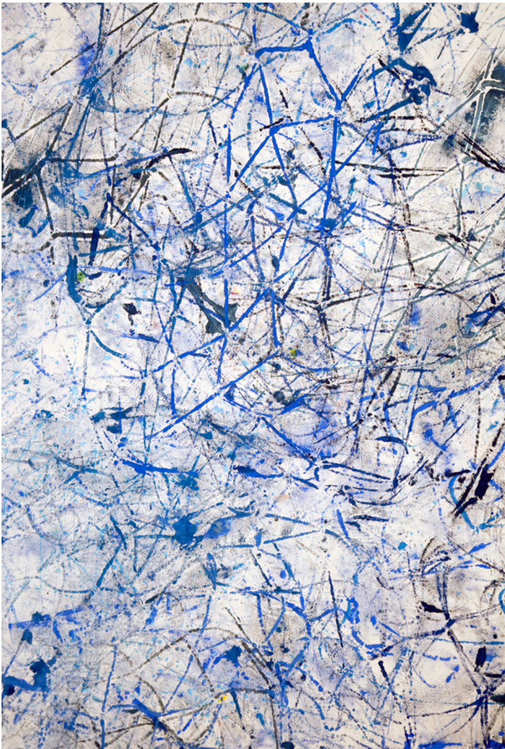
Vers. [detail] {2014}. Jonathan VanDyke.

VanDyke, like the Harlequin, is an artist between worlds of labor and play as much as his work exists between painting and performance. It is in this gap where the instability of the Harlequin's geometry takes hold. The hidden dimension in VanDyke's paintings is not the third dimension of Renaissance perspective and representational illusions of solid space, but rather the fourth dimension of time. Through the labor of producing painting, VanDyke gives glimpses and material evidence of the concealed dimensions of performance, intimacy and queer couplings. In Commedia dell'arte , the characters of Harlequin and the earnest yet melancholic Pierrot vie for the love of the beautiful Colombina in endless variations since the late 16 th century. But locked in the absence of Colombina inside VanDyke's studio, it is quite possible that Harlequin and Pierrot seduce each other in an excess of slurred color. As viewers we are left with the charged palimpsests of this motion and energy. For while artists may be coerced under capitalism to play the role of entertainer within rarified markets of intellect and aesthetics, there are some pleasures and intimacies of practice that resist possession. That is the trick.