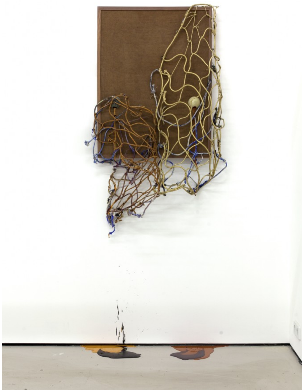
Beards. {2014} walnut wood, masonite, cast plastic, rope bondage costumes and pigmented urethane in dripping sequence, 26" x 34".

Jonathan VanDyke.