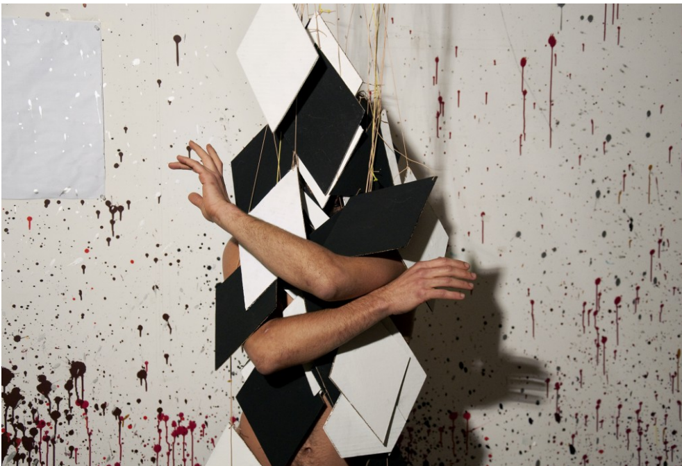
Father Figure. {2014} archival pigment print, 17.5" x 12", Edition of 3 + 2 AP. Jonathan VanDyke.

DESIREE D'ALESSANDRO [on] SANTIAGO ECHEVERRY