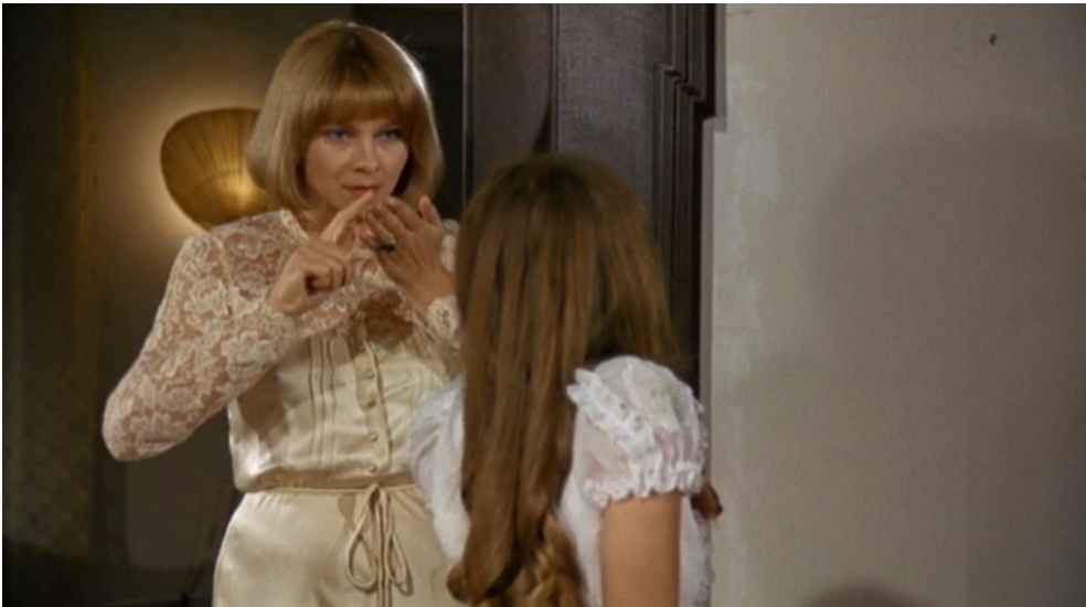
film still from Chinese Roulette (1976) Directed by Rainer Werner Fassbinder.

There is a hierarchy between the girl and Traunitz. And yet the speechless intelligence of Traunitz completes and complements the girl. In the film's denouement, the girl undermines her mother in a psychological game of 'Chinese Roulette.' The girl and Traunitz are two facets of a single trap. The girl speaks her cruelty aloud, while translating the signed gestures of Traunitz, whose disarmingly mute expression belies a blunt emotional honesty of disdain. Insults accumulate to the climactic affront that the mother's character matches that of an officer under the Third Reich. It is difficult to discern whether Traunitz is the girl's puppet, or if Traunitz directs the girl with pantomime hands. For this Traunitz must be shot by the enraged mother—taking the bullet that might have been reserved for the daughter. It results only in a minor flesh wound and flustered embarrassment. But the film ends with an exterior view of the Traunitz manor and the sound of a second shot, whose execution is left to the imagination.